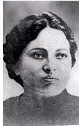
Pandita Mary Ramabai

April 5: Pandita Mary Ramabai, prophetic witness and evangelist in India, died on this day in 1922. An Anglican convert from Hinduism, Ramabai founded a mission to care for cast-off widows and orphans. She translated the Bible into Marathi, a West Indian language, and worked tirelessly among the poor. Her title, pandita , is a Sanskrit word that