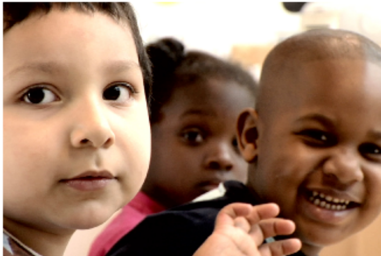
From the documentary “Jubilee” ( http://episcopalchurch.org/multimedia/jubilee )

For guidelines, additional information, and to apply for any of the grants, scan the QR code on the right or go to www.episcopalchurch.org/jubilee .