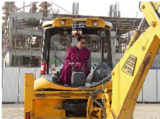
Breaking ground for the Anglican Church in Doha, Qatar

Collected funds can be sent in the form of a check, payable to "The Domestic and Foreign Missionary Society" (please write "Good Friday Offering" in the memo line of the check) to: