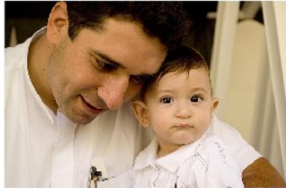
Priest and young congregant in the Diocese of Jerusalem

(To read the complete letter, see http://www.episcopalchurch.org/110049_126699_ENG_HTML.htm .)