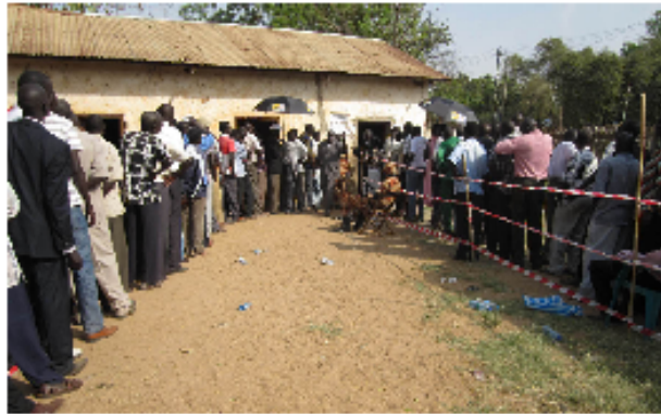
Line up for the referendum vote in Juba, January 9, 2011

Although an agreement was reached on June 13 between South Sudan and the north to demilitarize the Abyei region and to deploy Ethiopian peacekeeping troops in the area, and for the northern army to withdraw entirely from Abyei by July 9, continued violence is expected.