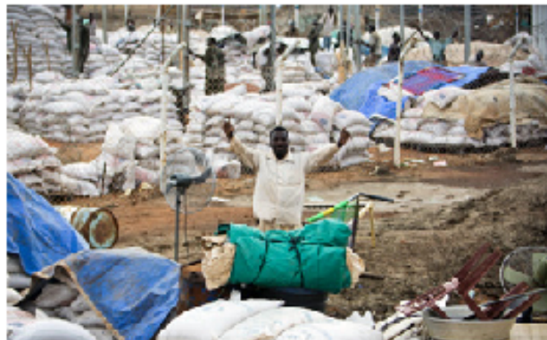
A UN food compound in Abyei being looted on May 24, 2011, handout photo by Reuters

On May 21, troops from Khartoum in northern Sudan attacked the oil-rich town of Abyei, located on the