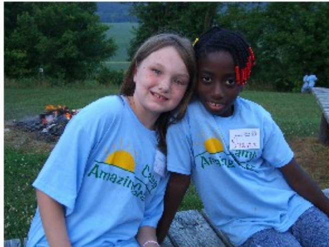
Campers at Camp Amazing Grace in the Diocese of Maryland

Thirteen Episcopal dioceses were awarded Jubilee Ministry partnership grants in 2011 to help fund their