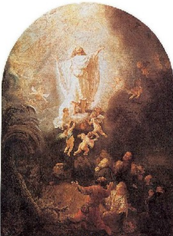
“The Ascension” by Rembrandt, 1636

“The third day he rose again according to the Scriptures and ascended into heaven, and sitteth on the right hand of the Father” (Nicene Creed, BCP, p. 328).