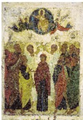
Russian Orthodox icon by Andrei Rublev, 1408

Acts 1: 6-11 (NRSV): “So when they had come together, they asked him, ‘Lord, is this the time when you will restore the kingdom to Israel?’ He replied, ‘It is not for you to know the times or periods that the Father has set by his own authority. But you will receive power when the Holy Spirit has come upon you; and you will be my witnesses in Jerusalem, in all Ju-