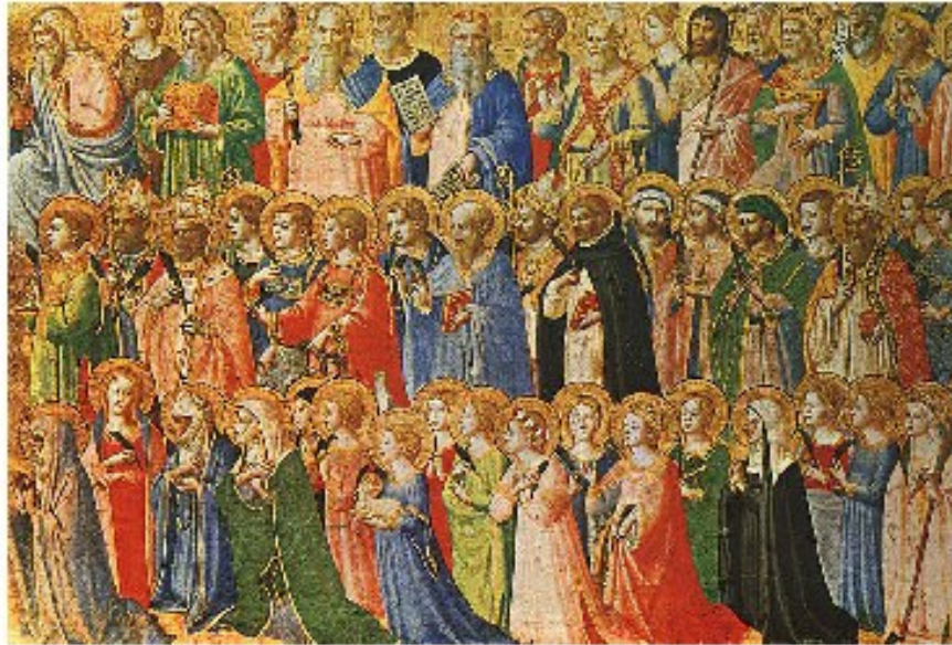
Fra Angelico's "The Forerunners of Christ with Saints and Martyrs" (circa 1424)

Increasingly, many congregations within the Episcopal Church, especially Latino/Hispanic, celebrate the Day of the Dead ( Día de los Muertos ) on November 2 (All Souls' Day). This Mexican tradition, which can be traced back to an ancient Aztec festival, brings families and friends together to remember and pray for their loved ones who