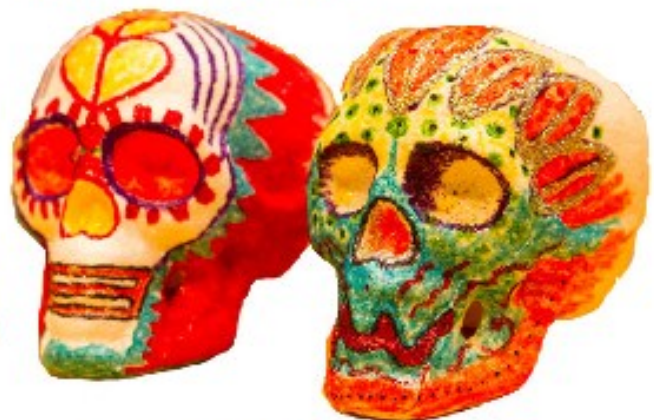
Sugar skulls for Días de los Muertos